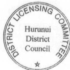
Secretary Hurunui District Licensing Committee